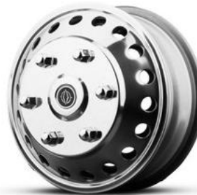
Steel Wheels Standard - With Wheel Simulators