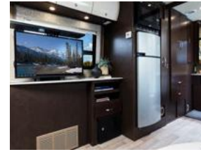
Espresso Brown 50th Anniversary Décor Package