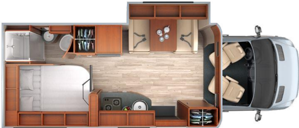
U24CB Corner Bed (Shown with standard Booth Dinette)