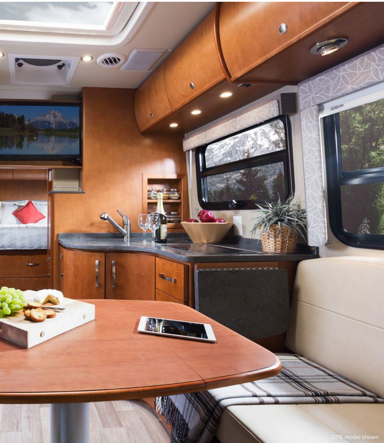
2015 model shown.