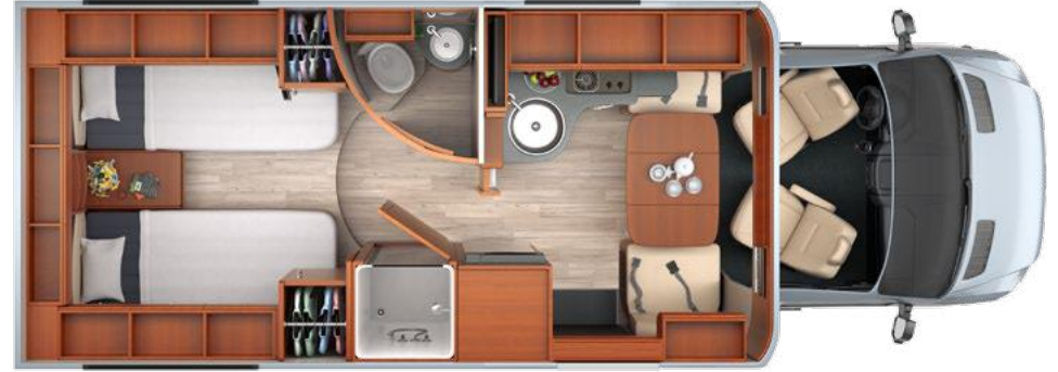
U24TB Twin Bed