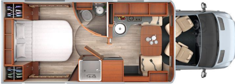
U24IB Island Bed