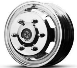
Alcoa Dura-Bright® Aluminum Wheels Optional - All 6 Wheels