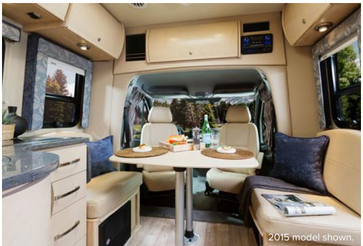
2015 model shown.