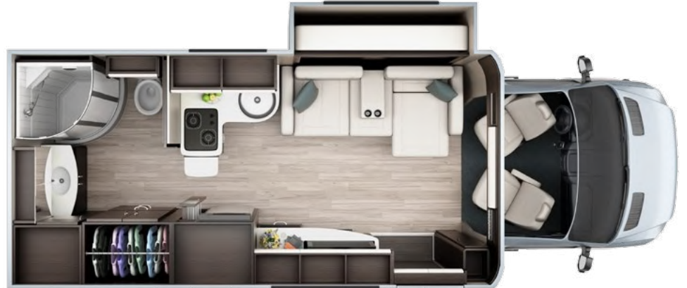
U24MB Murphy Bed (Shown with New Leisure Lounge)